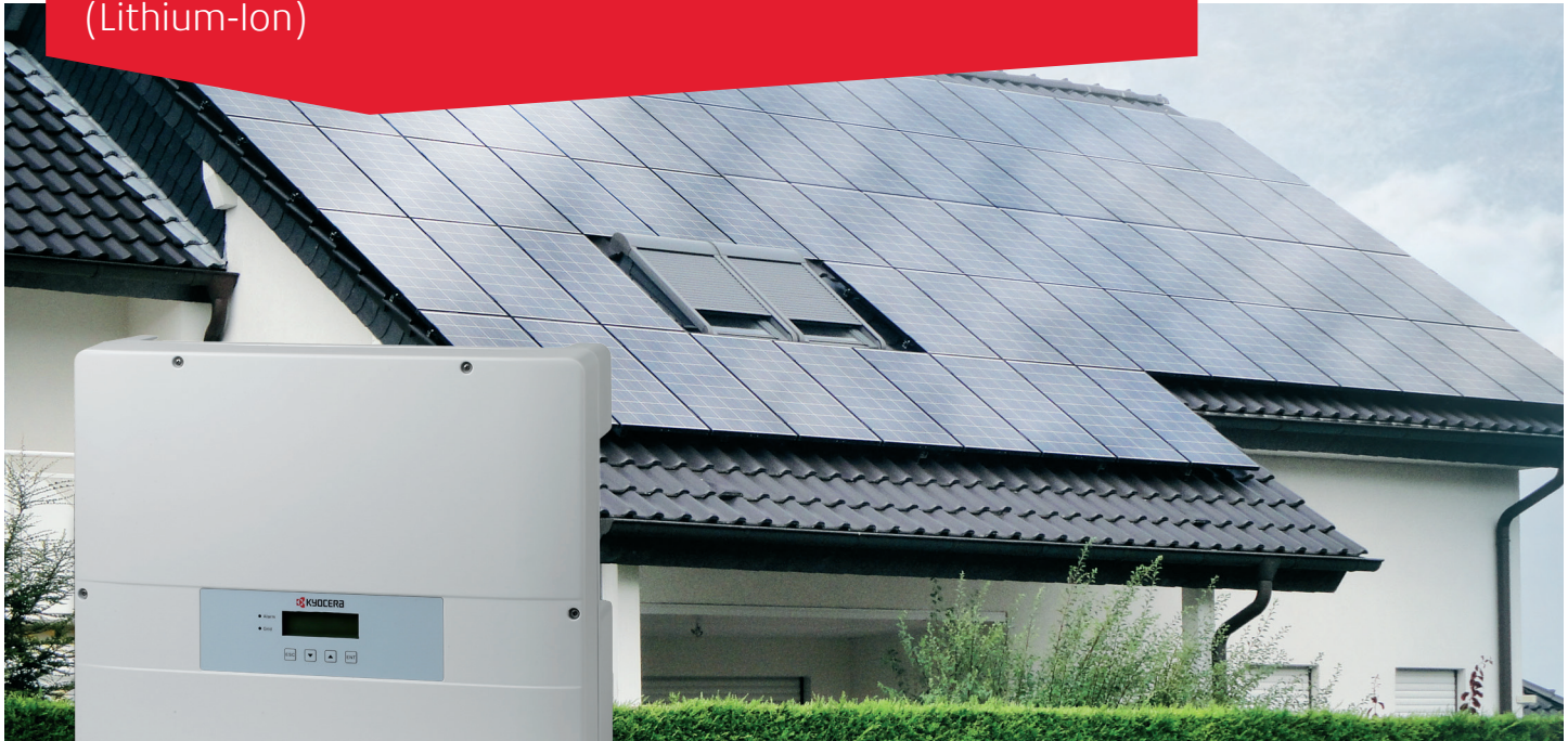
Residential home, Germany